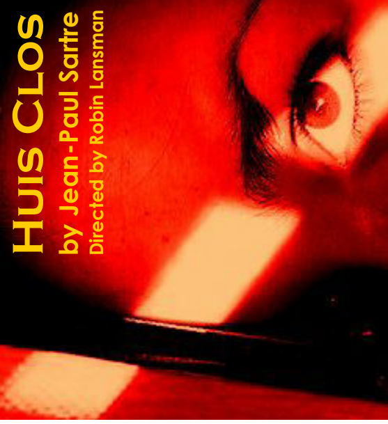
Subject to licence

Tickets £8 Lambeth & Southwark Residents £7. For latest information and to book tickets (online booking fee) go to www.networktheatre.org Doors open 30 minutes before each performance — why not relax in our licensed bar, which is open before and after the show